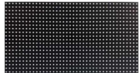
Module: Front View