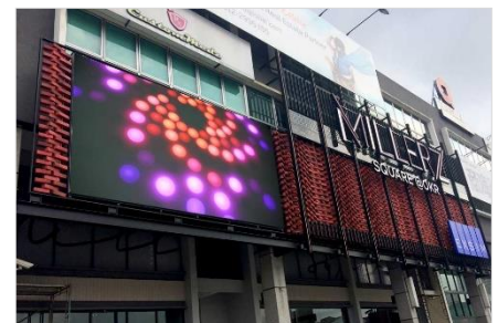
Excim Millerz Square, Old Klang Road