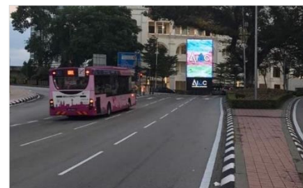
AIAC, Jalan Sultan Sulaiman