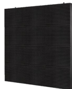
Panel: Side View