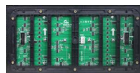
Module: Front and Rear View