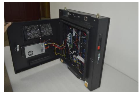
Panel: When Rear Door is opened