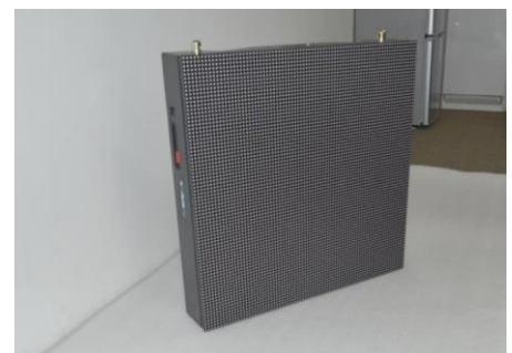
Panel: Front View