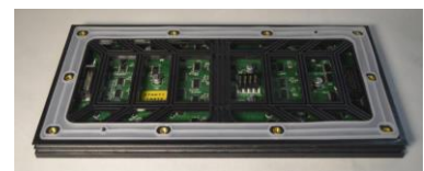
Module: Front and Rear View