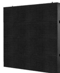
Panel: Side View