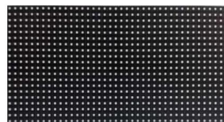
Module: Front View