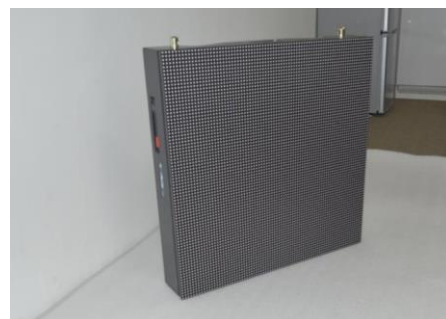
Panel: Front View